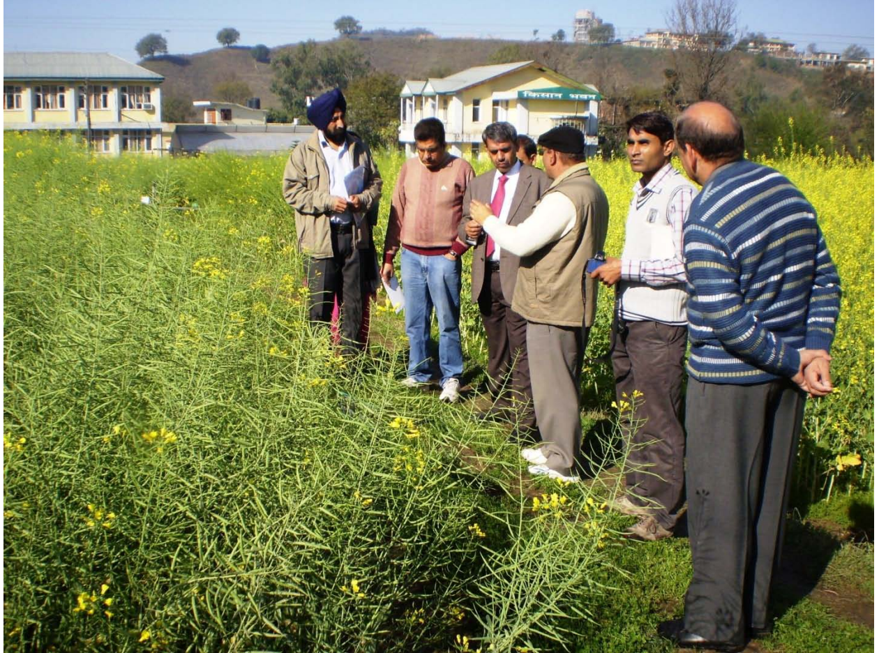
Monitoring team visiting SAREC Kangra