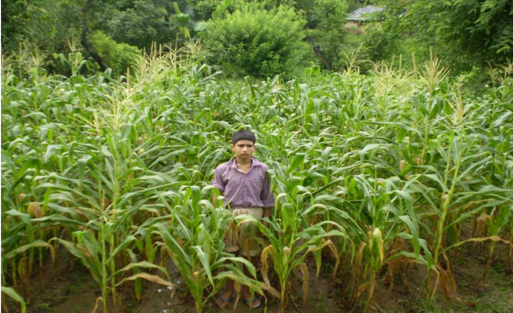
Seed production plot of maize hybrid HQPM-1 at farmer's field in village Palera(Kangra)