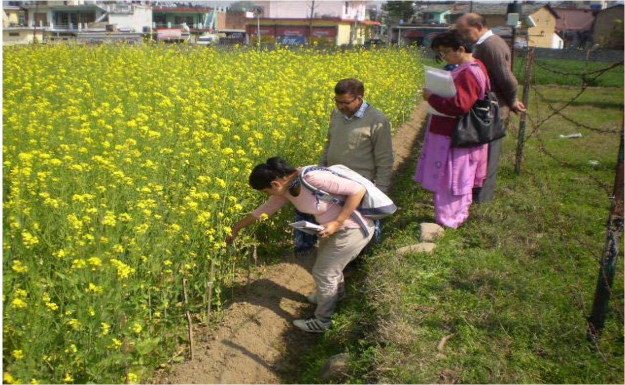
Monitoring Team Members visited Rapeseed-Mustard Research Trials at Kangra on 24 th February 2016