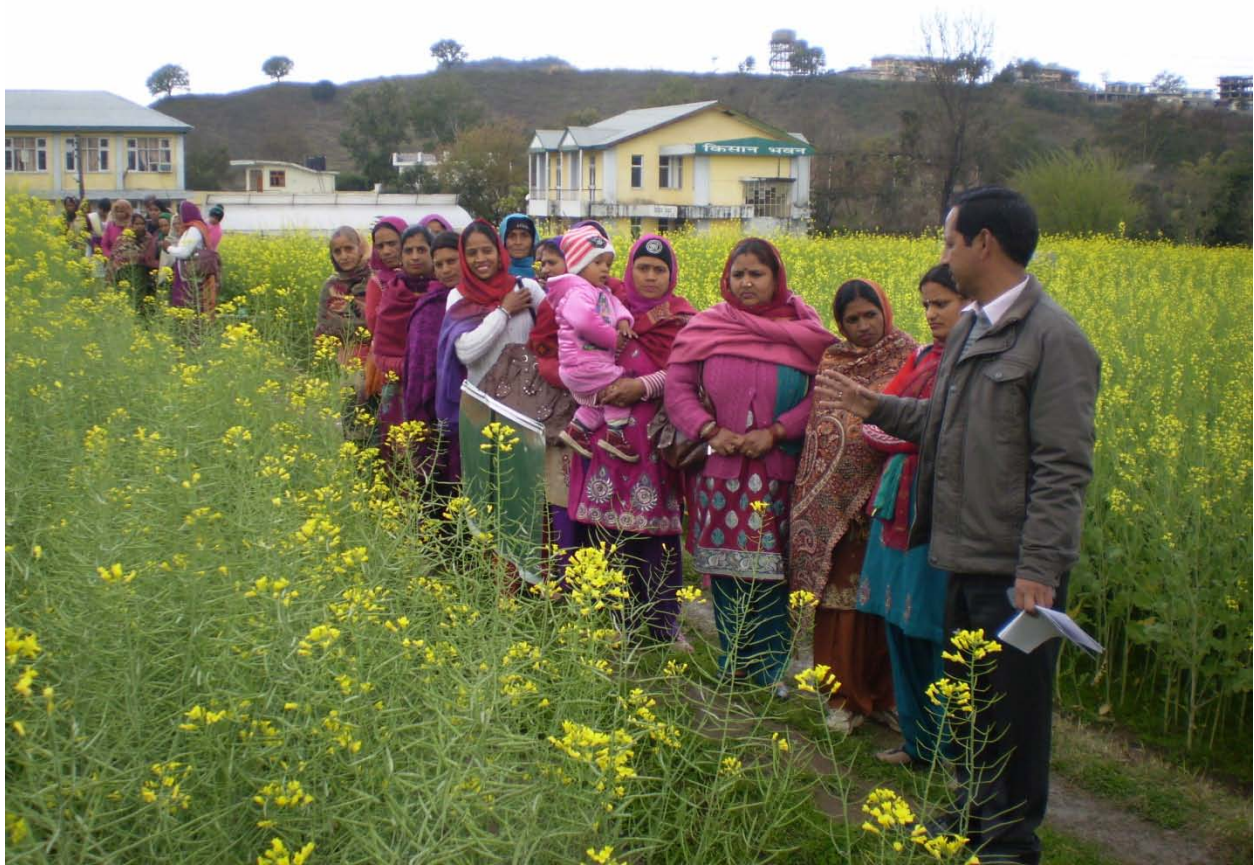
Demonstration of improved technology by Scientist of SAREC Kangra on the occasion of Tilhan Divas