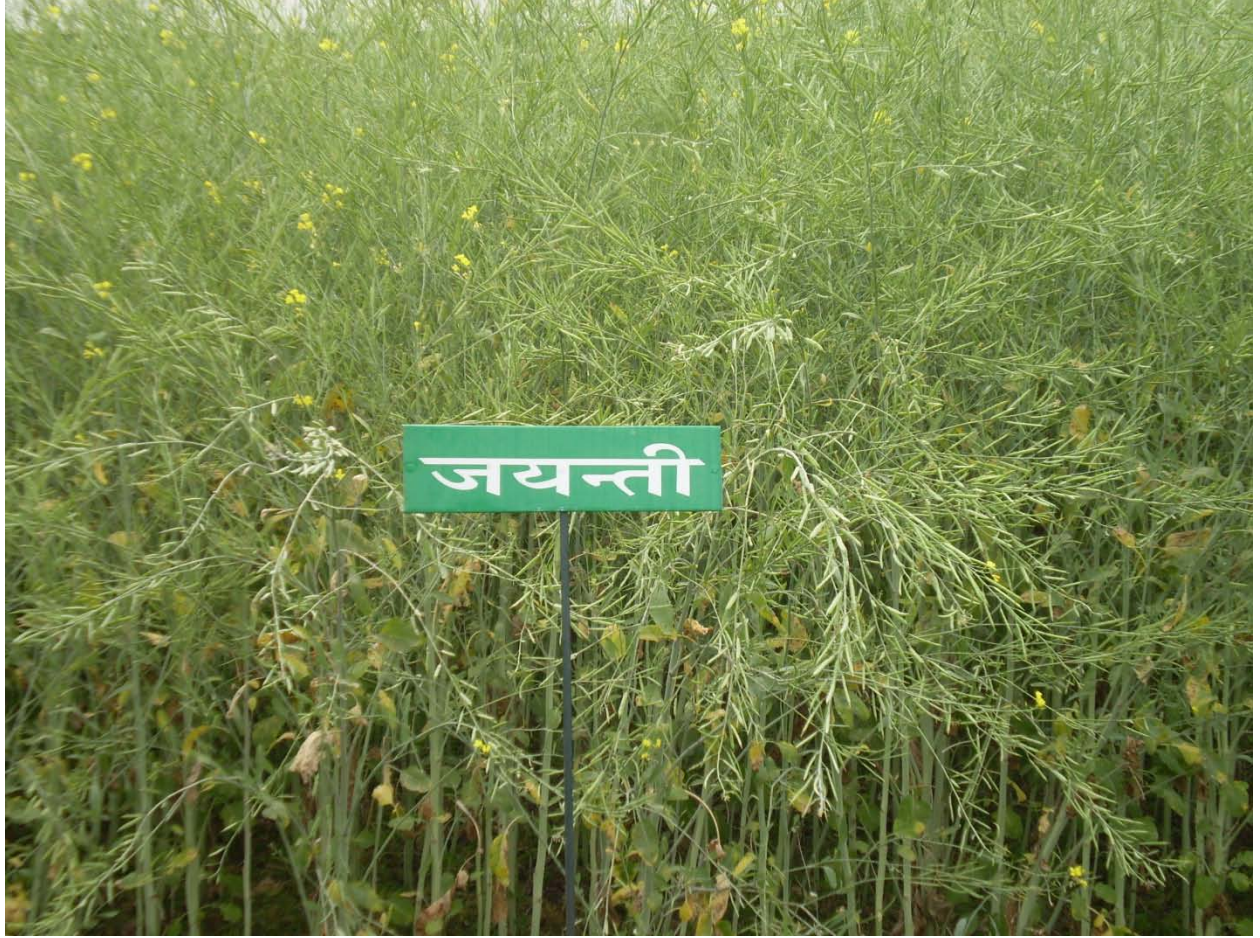
Demonstration plot of Raya variety Jayanti at SAREC Kangra