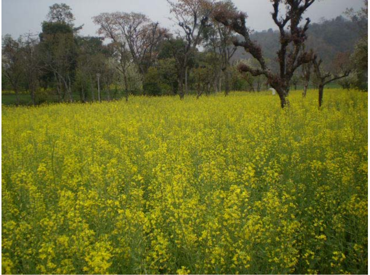
Demonstration of gobhi sarson variety ONK-I in farmer's field in Kangra District