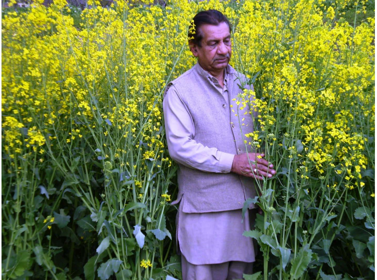
Demonstration of gobhi sarson variety GSC-07 in farmer's field in Solan District