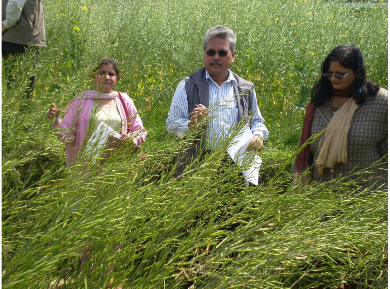
BARC Scientist interaction with Scientists of SAREC Kangra