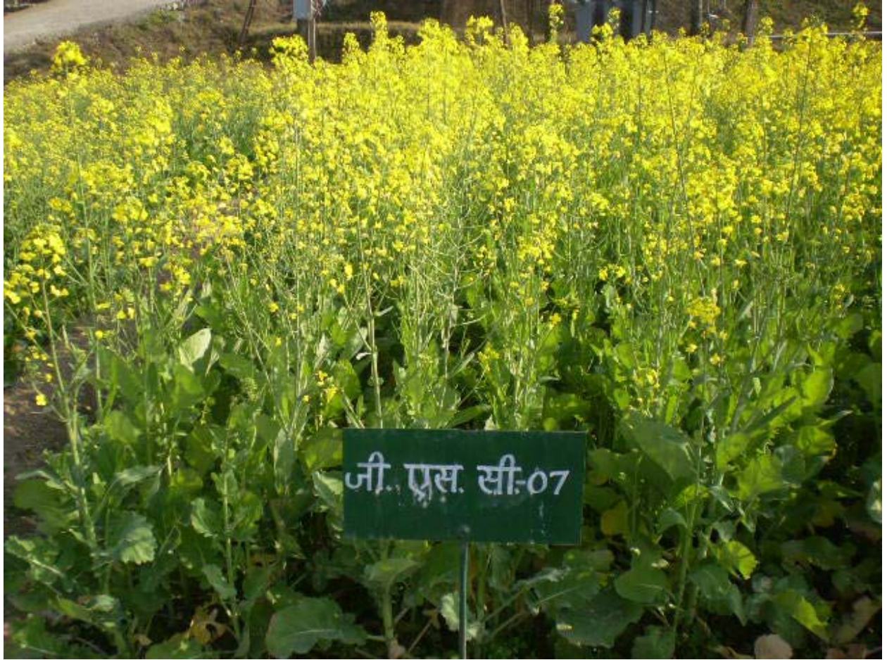
Demonstration plot of gobhi sarson variety GSC-07 at SAREC Kangra