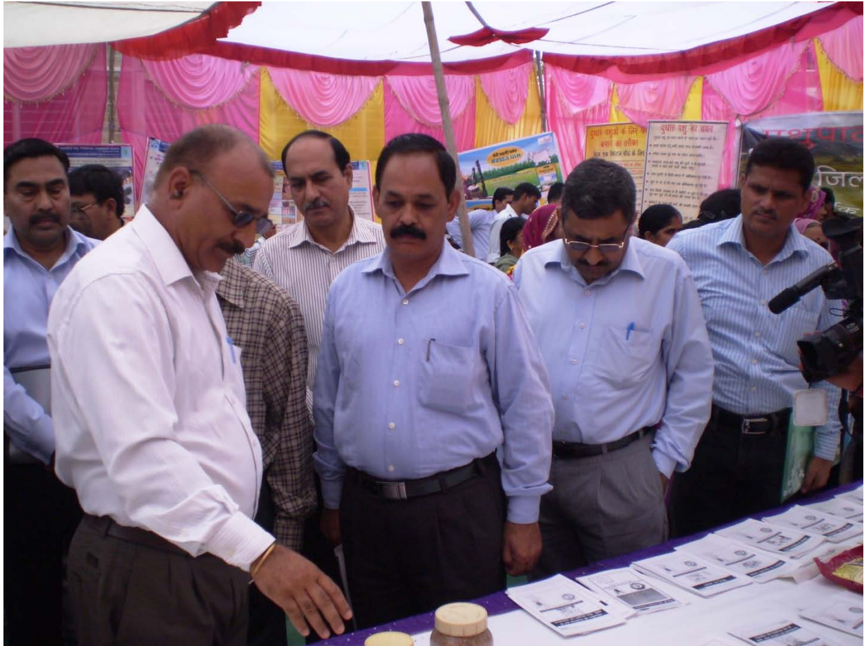
Exhibition on the occasion of Kisan Divas