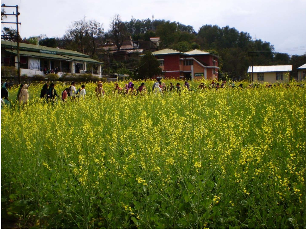
A view of SAREC K angra