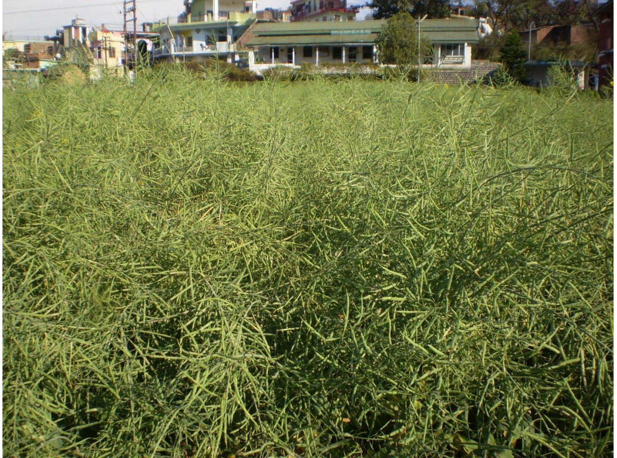
Demonstration of GSC-07 at SAREC Kangra