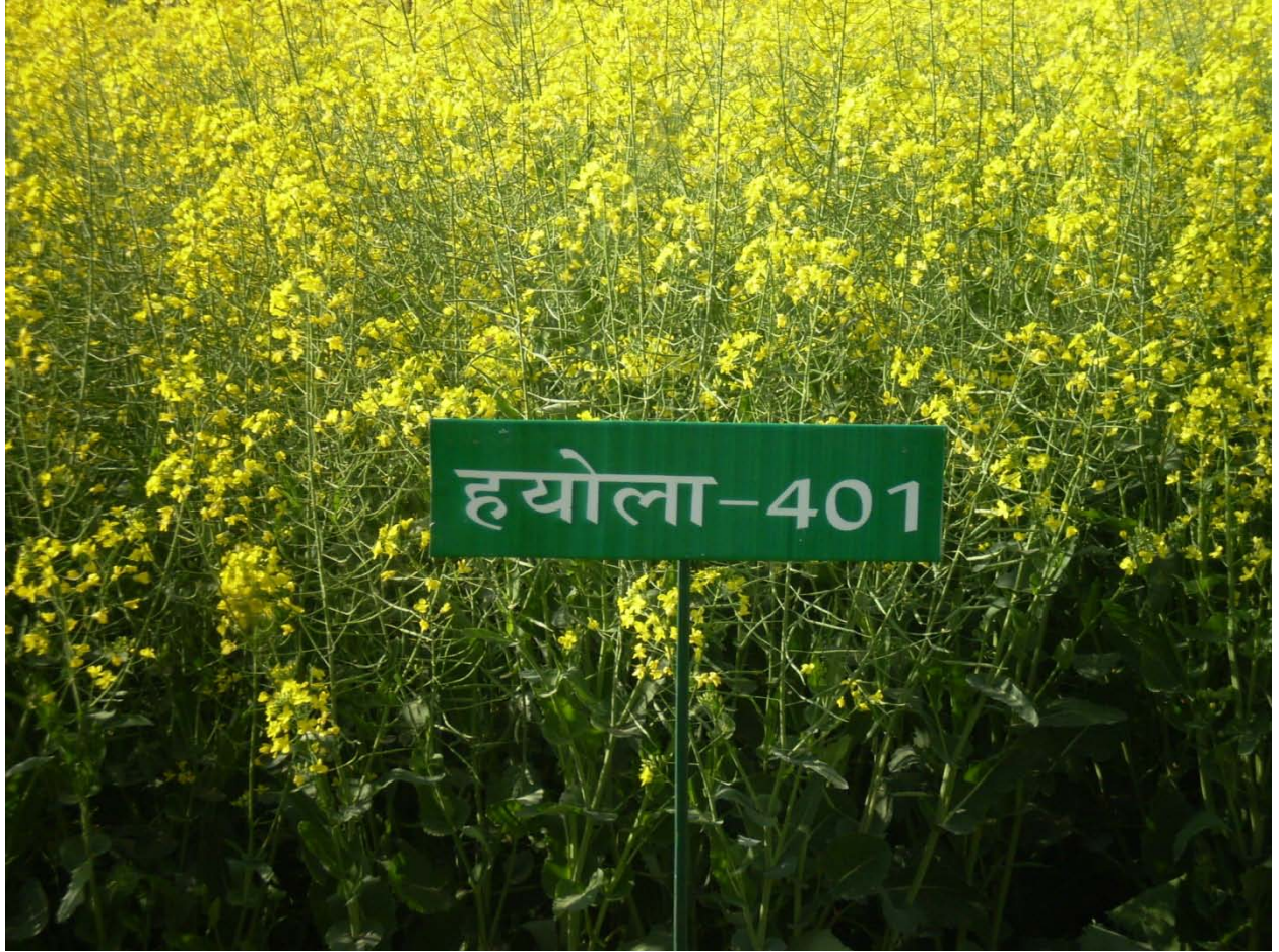
Demonstration plot of gobhi sarson hybrid Hayola-401