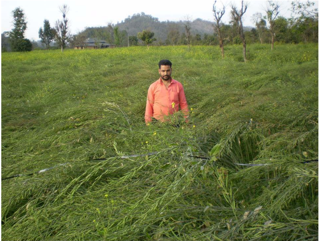
Demonstration of Raya variety RCC-4 in farmer's field in Kangra District