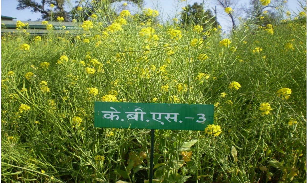
Demonstration plot of brown sarson variety KBS-3 at SAREC Kangra