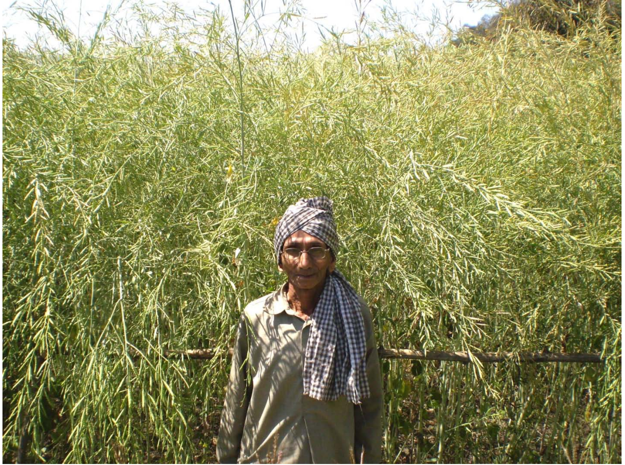
Demonstration of Karan rai variety Jayanti in farmer's field in Kangra District