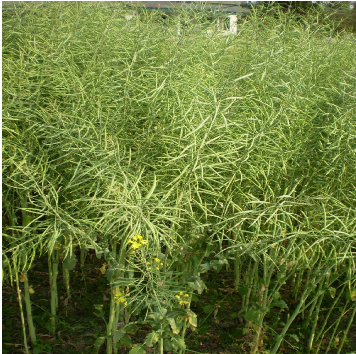
Demonstration plot of gobhi sarson variety Sheetal at SAREC Kangra