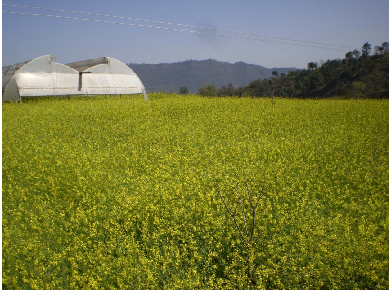
Demonstration of Karan rai variety Jayanti in farmer's field in Hamirpur District