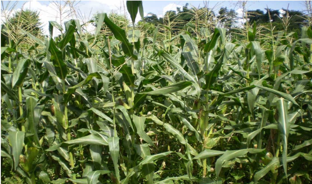
Demonstration plot of maize hybrid HQPM-1 at village Khundian (Kangra)