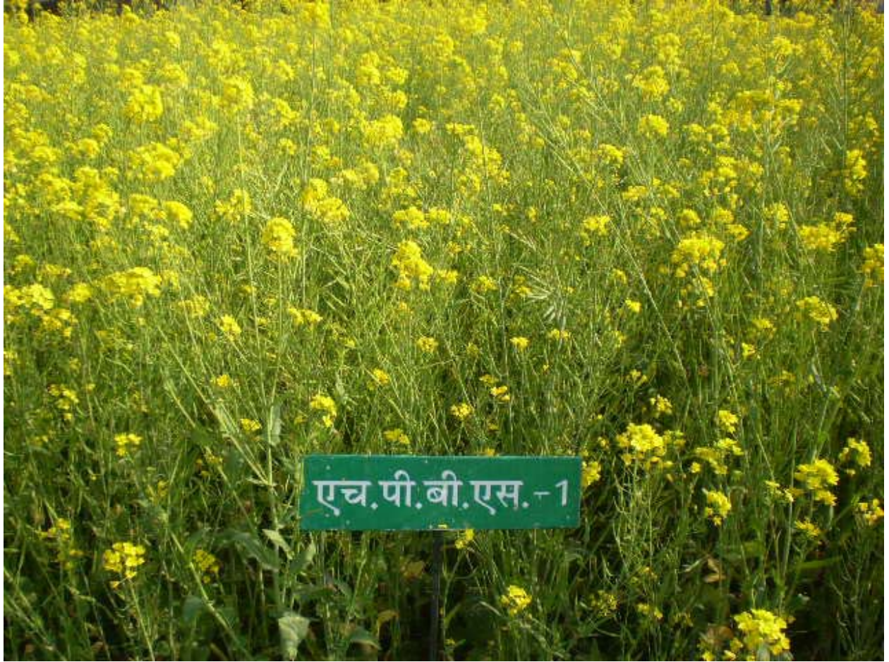
Demonstration plot of brown sarson variety HPBS-1 at SAREC Kangra