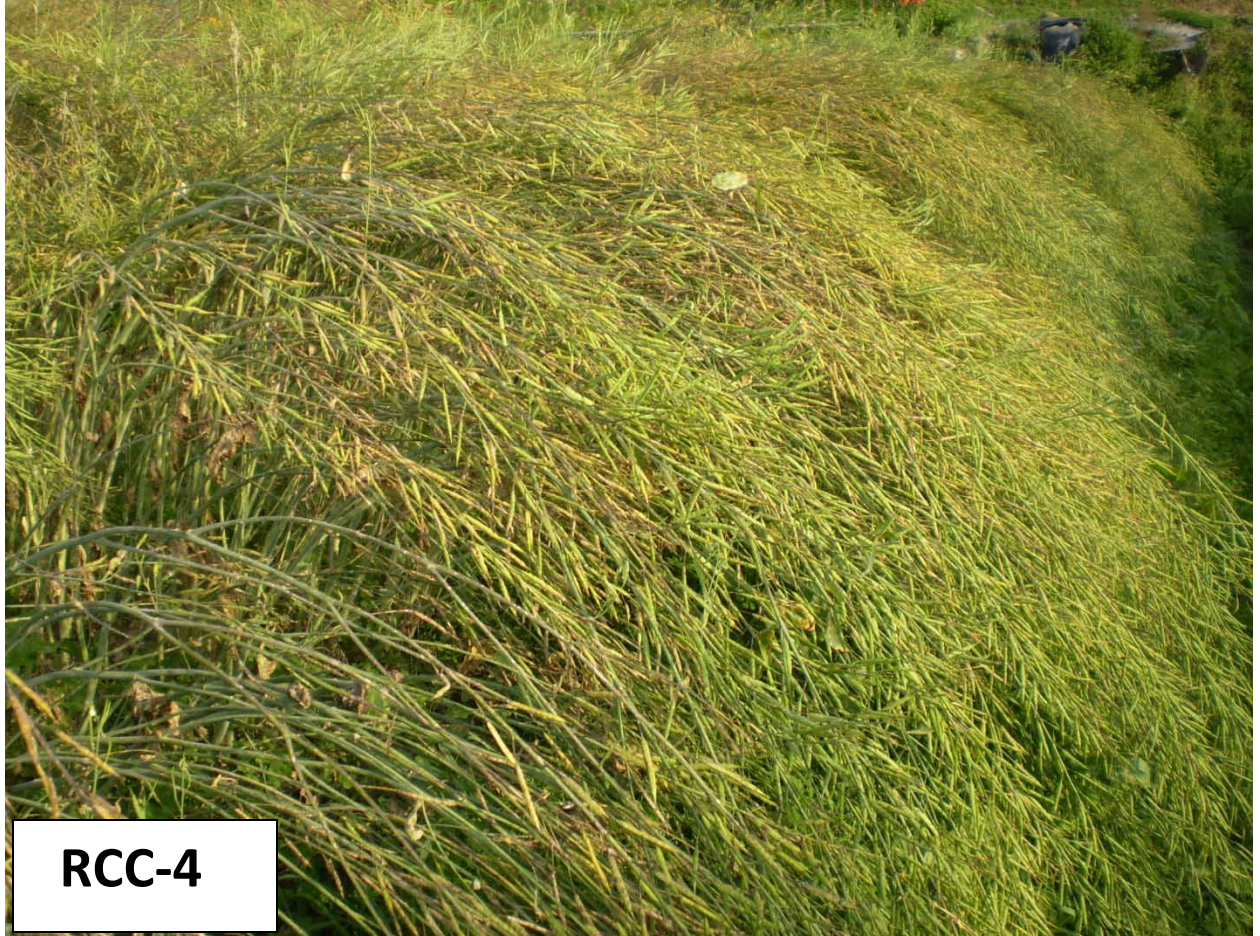
Demonstration plot of mustard variety RCC-4 at SAREC Kangra