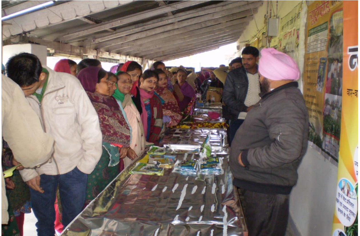
Exhibition on the occasion of Tilhan Divas