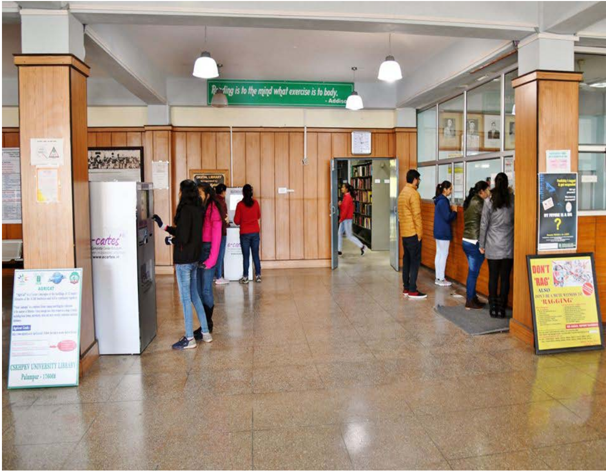
RFID Library System