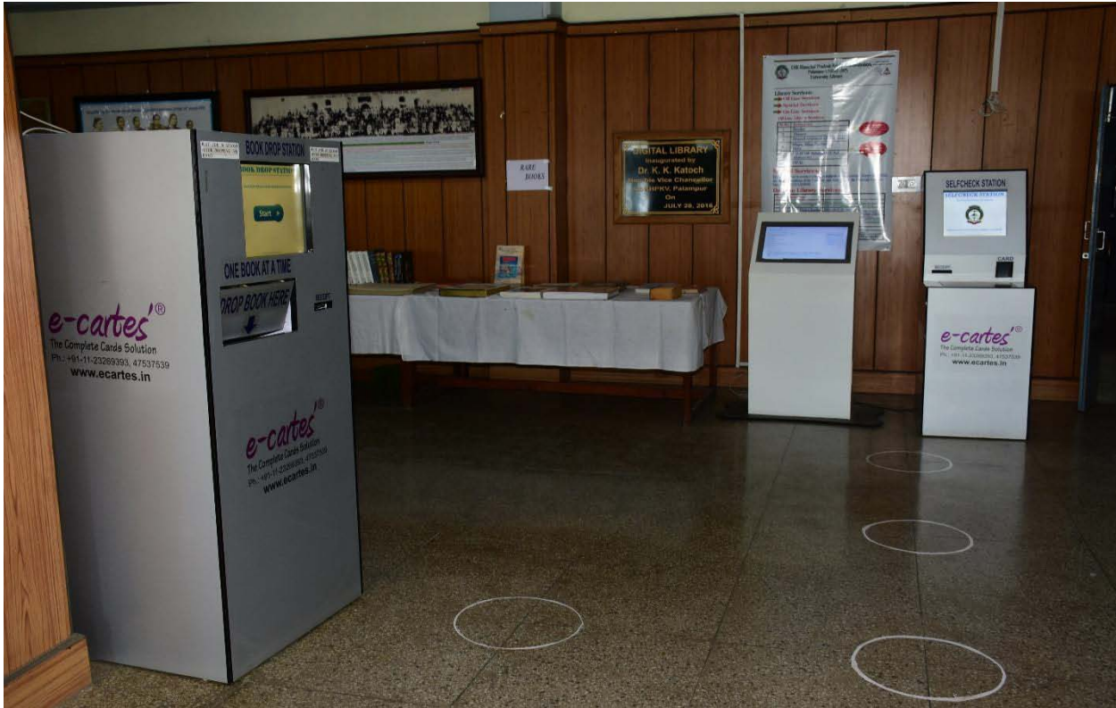
Touch Screen Kiosks & self-check in/out station