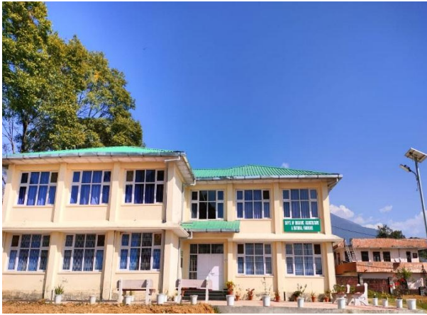
Creation of facilities in new Office Building