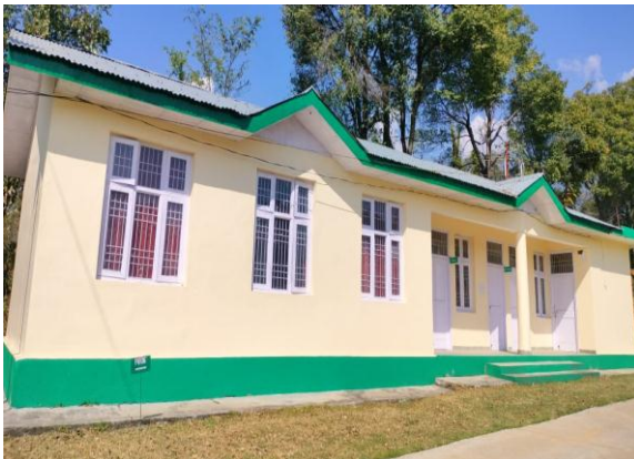
A separate Conference hall, Library & Store room