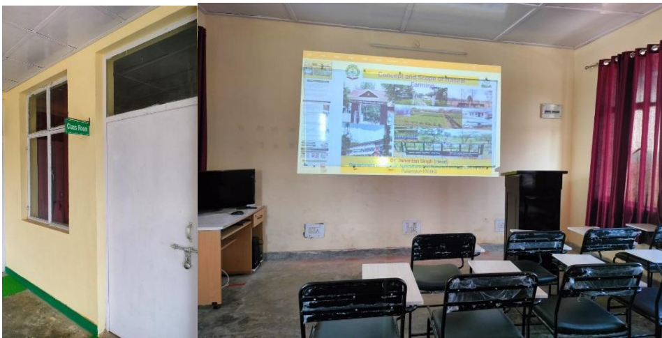
ELP teaching with all the facilities