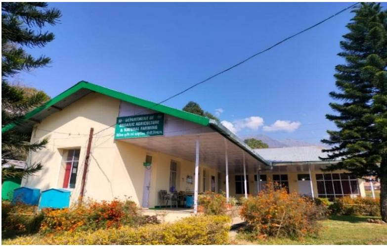
Renovated old Farm Building