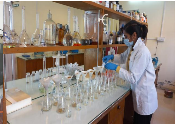
Well equipped Soil and Microbiology laboratories