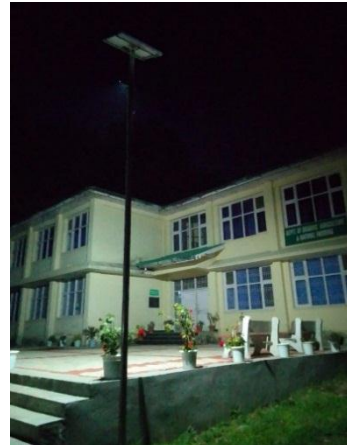
Solar light facility