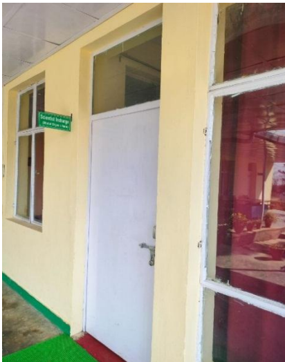
Farm Incharge room