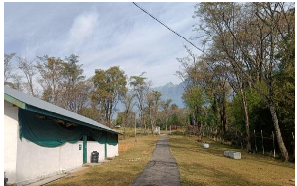
Metalling of the approach road from University workshop to ZBNF Centre