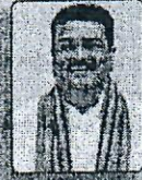
Shri Dharmendra Pradhan Hon'ble Union Minister of Education and Skill Development and Entrepreneurship